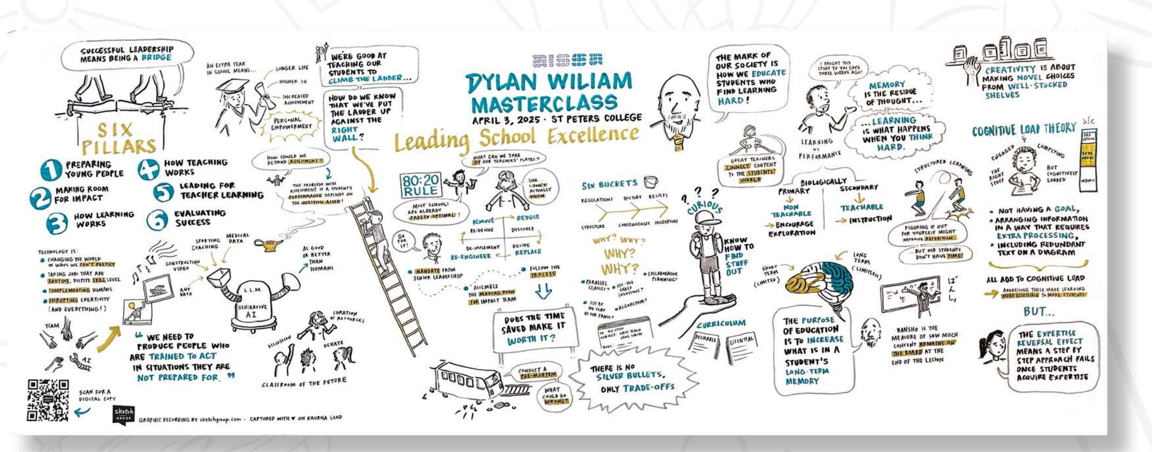
Day 1: April 3, 2025