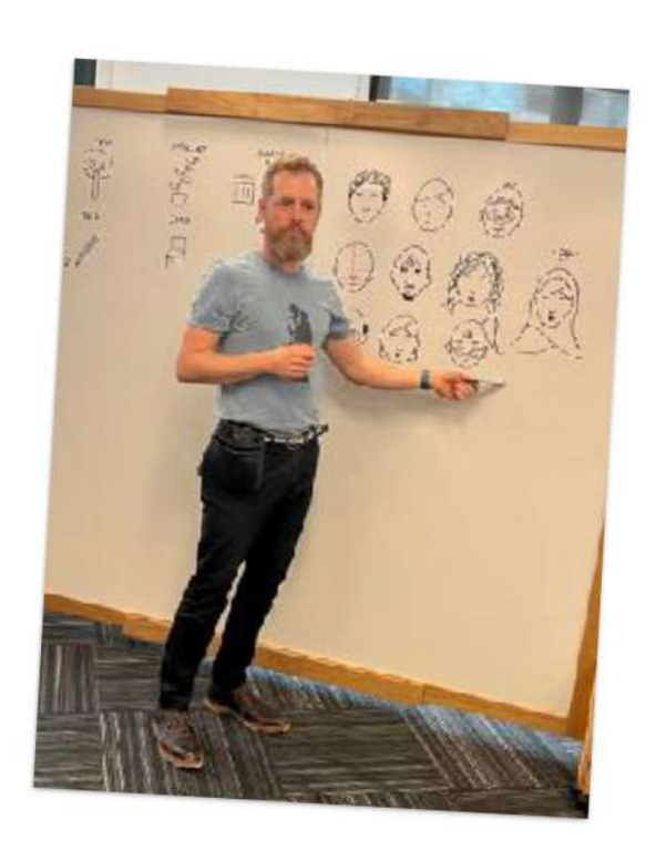
Visualise your school's strategic plan