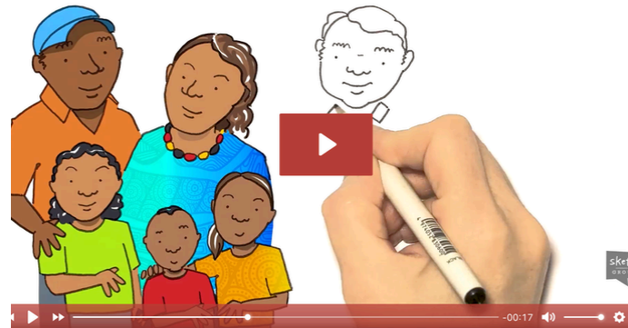
Engage constituents with compelling campaigns