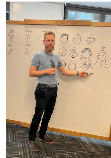
Train staff in visual thinking skills